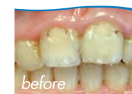
or create a winning smile!