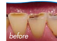
Restore worn teeth with beautiful tooth-colored restorations...