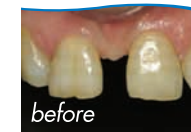
Fix unsightly gaps....